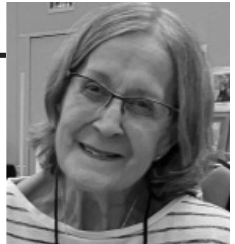
Central Washington University

I am still active in community groups but these last couple of years have been a challenge. I get to present a program for the February 6th meeting called “ Just in Case ” and hope you will attend and bear with me. Wish me luck and be kind!